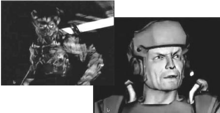
Doom 3 (id Software, 200x)