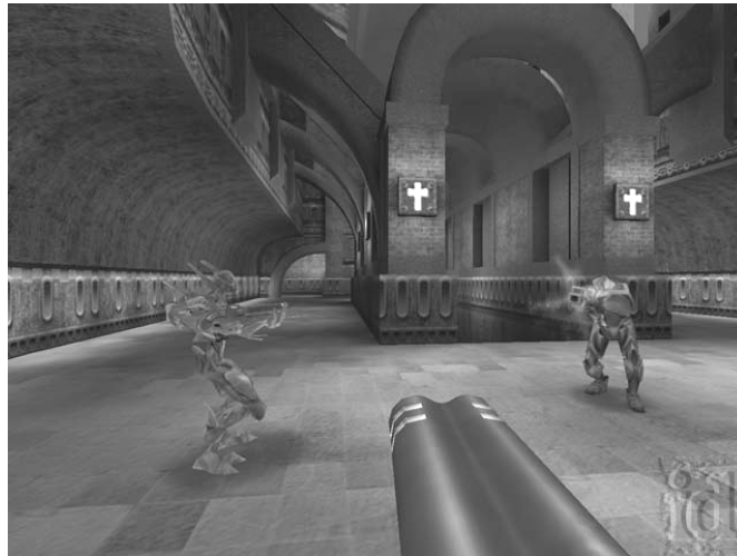
Quake 3 Arena (id Software, 1999)