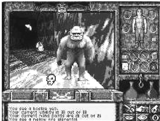
Ultima Underworld (Looking Glass, 1992)