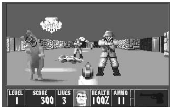
Wolfenstein 3D (id Software, 1992)