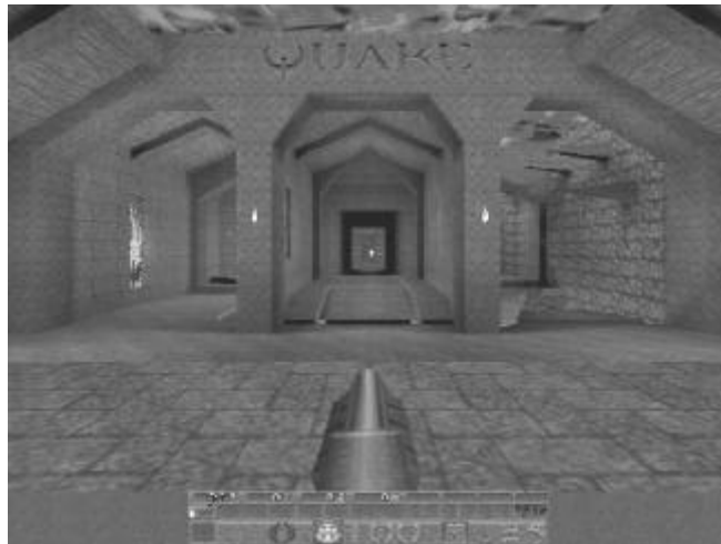
Quake (id Software, 1996)