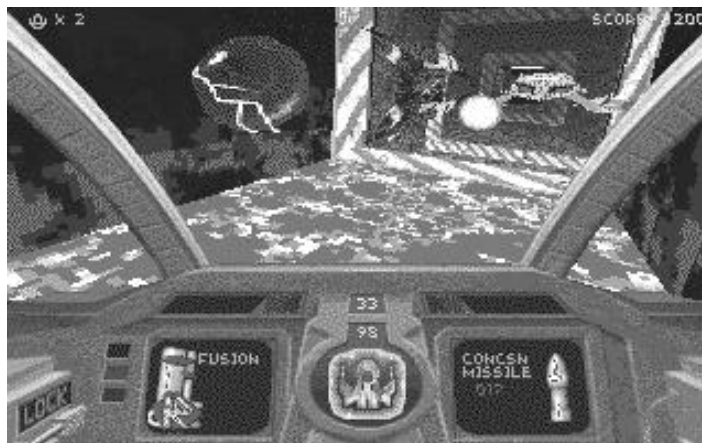
Descent (Parallax Software, 1994)