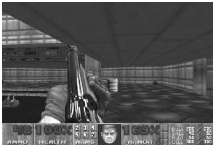
DOOM (id Software, 1993)